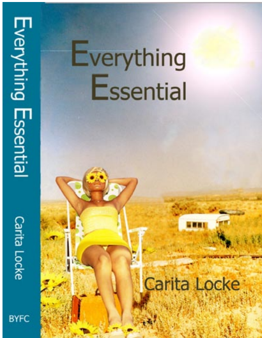
Front of Book